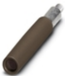
Female test connector, color: brown

Female test connector - PSBJ-URTK 6 BN - 3026971