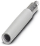
Female test connector, color: white

Female test connector - PSBJ-URTK 6 WH - 3026448